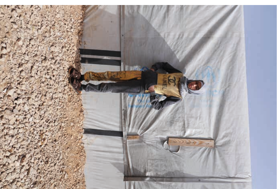
Images captured by ReIFuse magazine during a trip to the Bekaa Valley, one of the largest Syrian refugee settlements in Lebanon. (Find out more at www.refusemagazine.com )