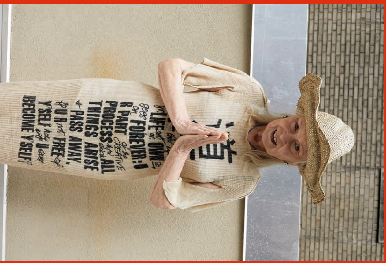
Vivienne Westwood